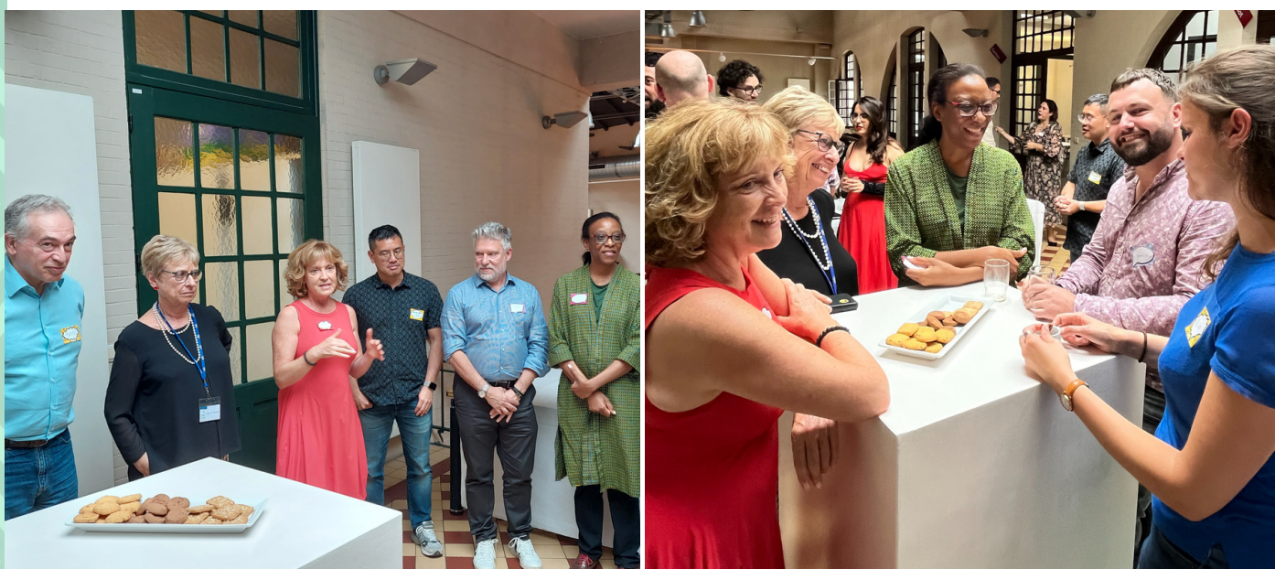
ExCo members meet pre-candidates in Brussels